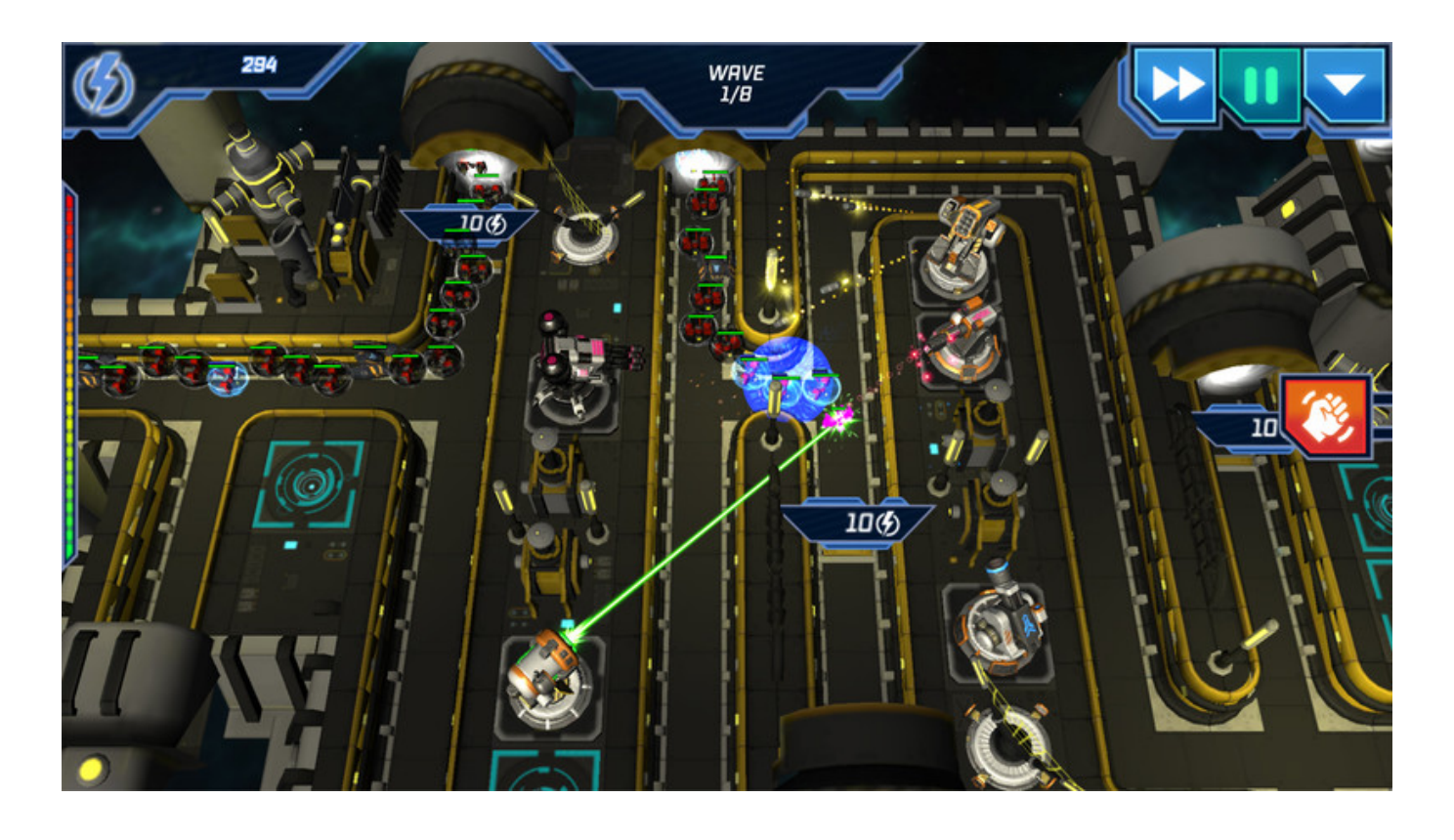
Module TD. Sci-Fi Tower Defense Download Ubuntu